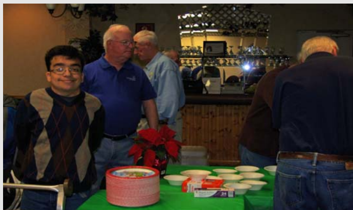
Just a few of the Brother Knights serving food at GSP Christmas Party

(RESERVATION IS OFFICIAL. No calls will be made.)