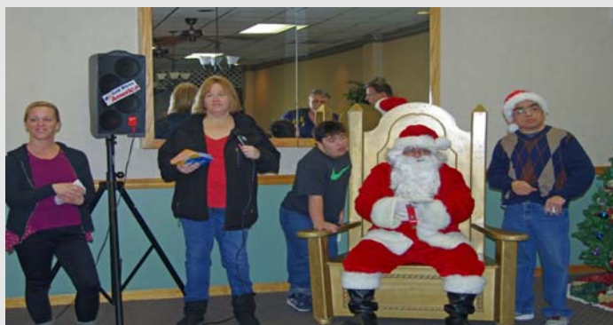
Santa and his helpers giving out Christmas gifts to GSP attendees