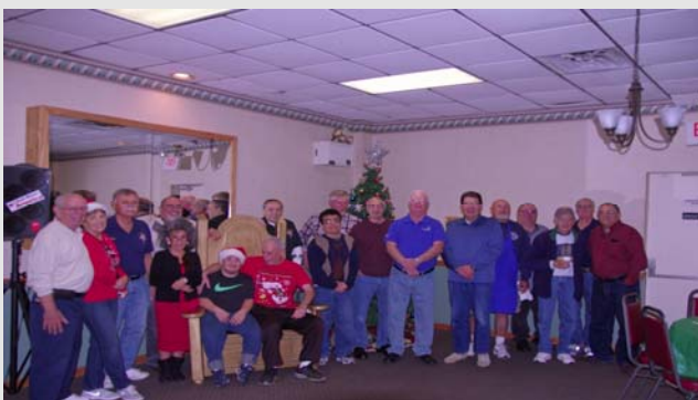
Brother Knights helping at the GSP Christmas Party